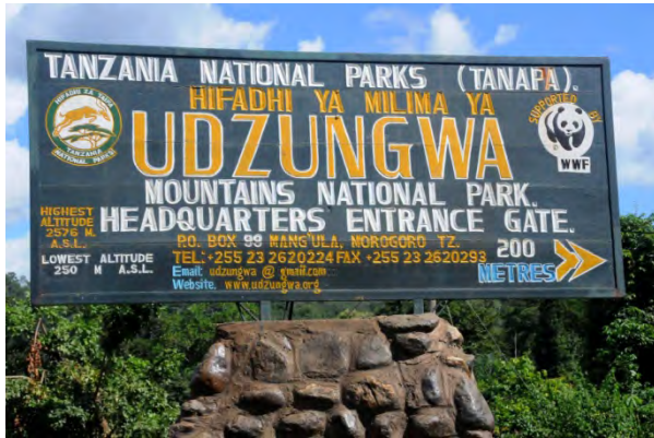
Figure 1. Park Headquarters

Stuckeman School of Architecture and Landscape Architecture, Penn State University