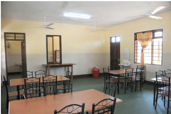
Figure 9. Hostel dining room