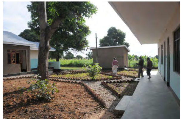
Figure 16. Hostel courtyard