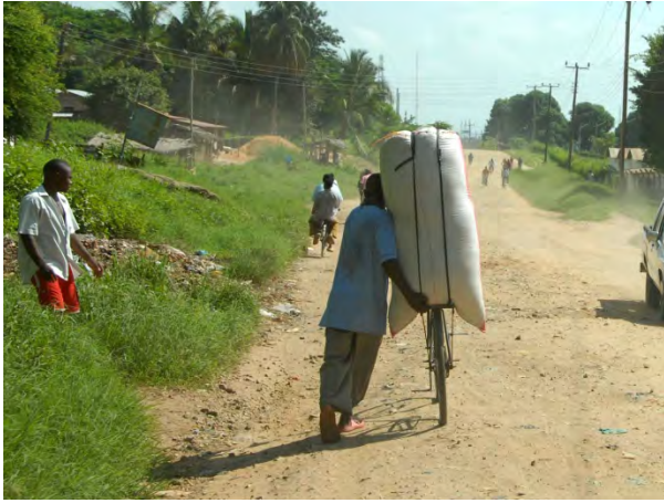
Figure 13. Charcoal for domestic fuel