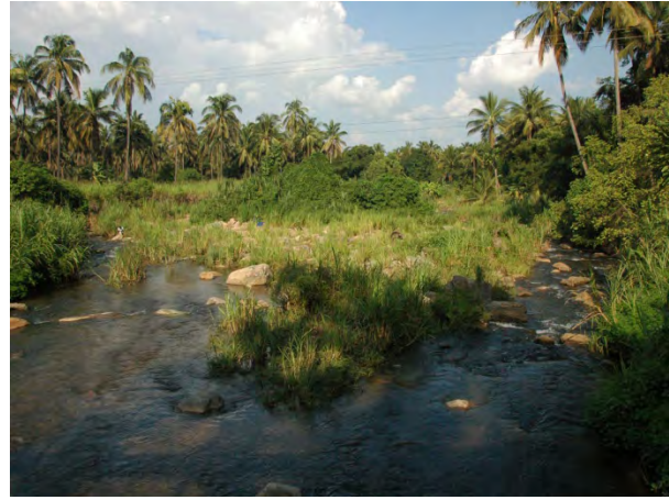
Figure 14. Water for irrigation, bathing etc.