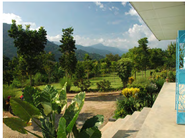
Figure 10. Ecological Monitoring Centre