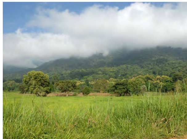
Figure 12. Commercial farming