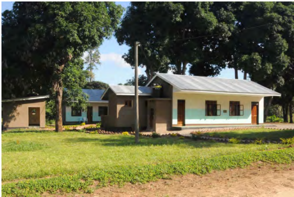
Figure 15. UEMC Hostel