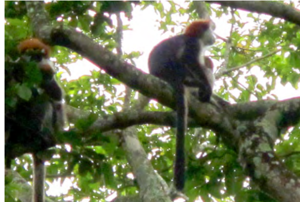
Figure 2. Endemic Udzungwa red colobus