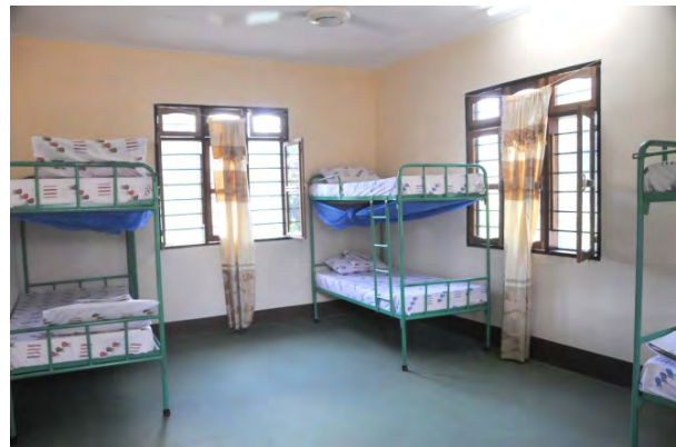
Figure 10. Typical hostel bedroom