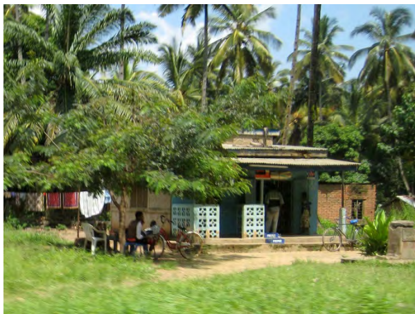
Figure 11. Encroaching villages