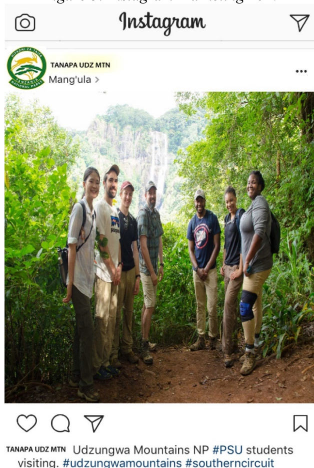
Figure 3: Instagram Marketing 2017

UMNP Head Quarters has a Tourism Department that will carry out its social media marketing campaign. Should assistance be needed in the managing of social media, the young and able population of Tanzania will be able to assist in managing a robust social media campaign. With low costs, simple strategies, and wide reach, this campaign will provide an identity for UMNP as a unique destination. A social media platform like Instagram, provides a simple way for UMNP to reach a mass audience. Figure 3 shows an example of college students at Sanje Falls. By utilizing hashtags, which aggregate popular search terms, UMNP is able to penetrate foreign markets.